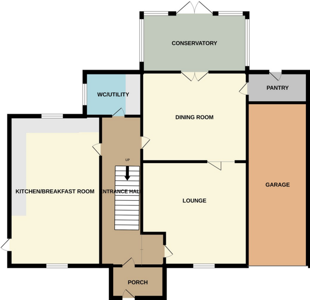
GROUND FLOOR 1135 sq.ft. (105.5 sq.m.) approx.